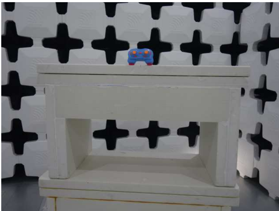
Above 1GHz (The EuT placed at the center of the turntable)