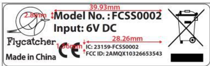
Rating label engraved at bottom of the product