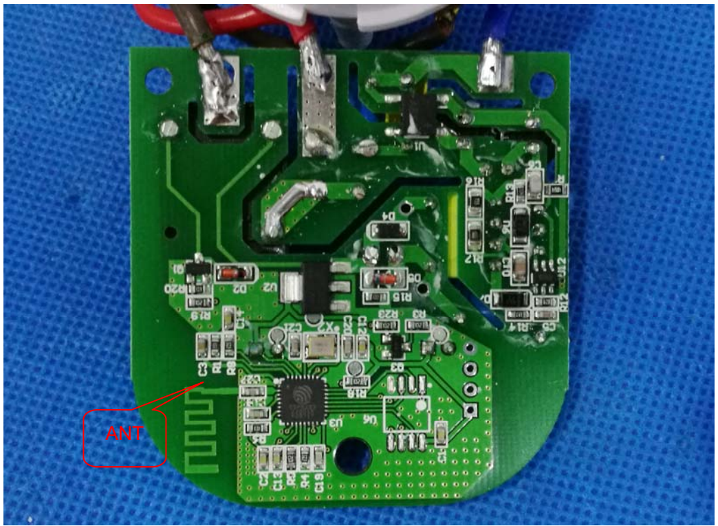
**End of report**