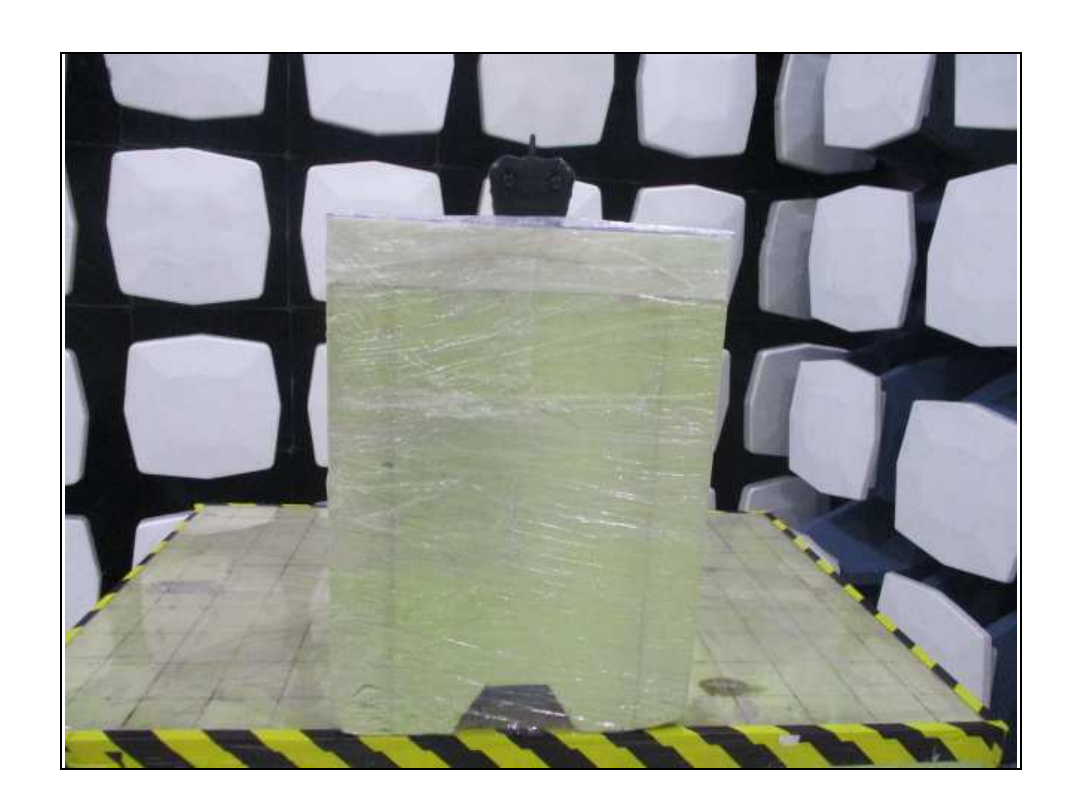
(EUT was placed in the centre of the turntable) Above 1GHz