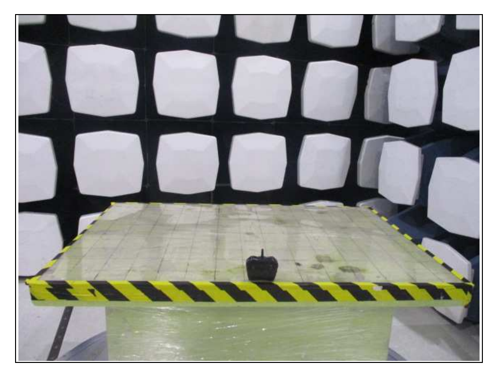
(EUT was placed in the centre of the turntable) Below 1GHz