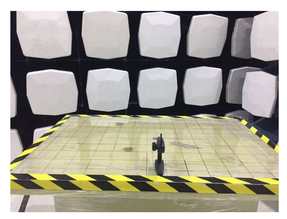
Up to 1GHz (The EuT placed at the center of the turntable)