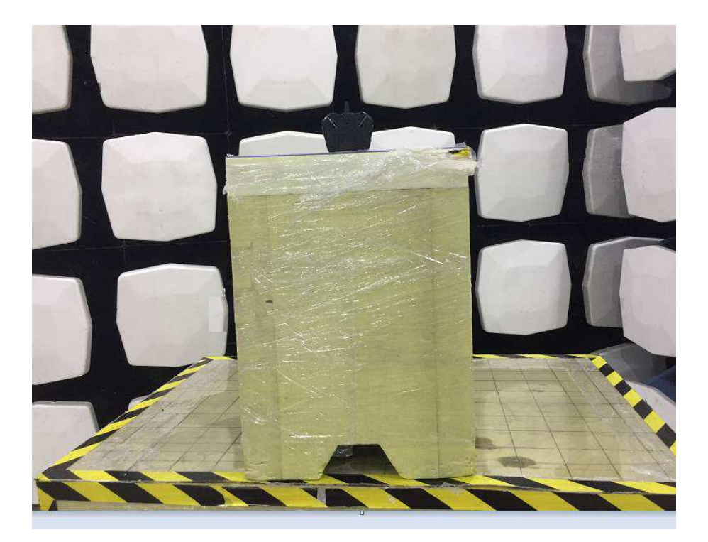
Above 1GHz (The EuT placed at the center of the turntable)