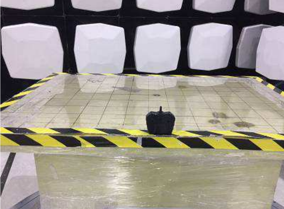
Up to 1GHz (The EuT placed at the center of the turntable)