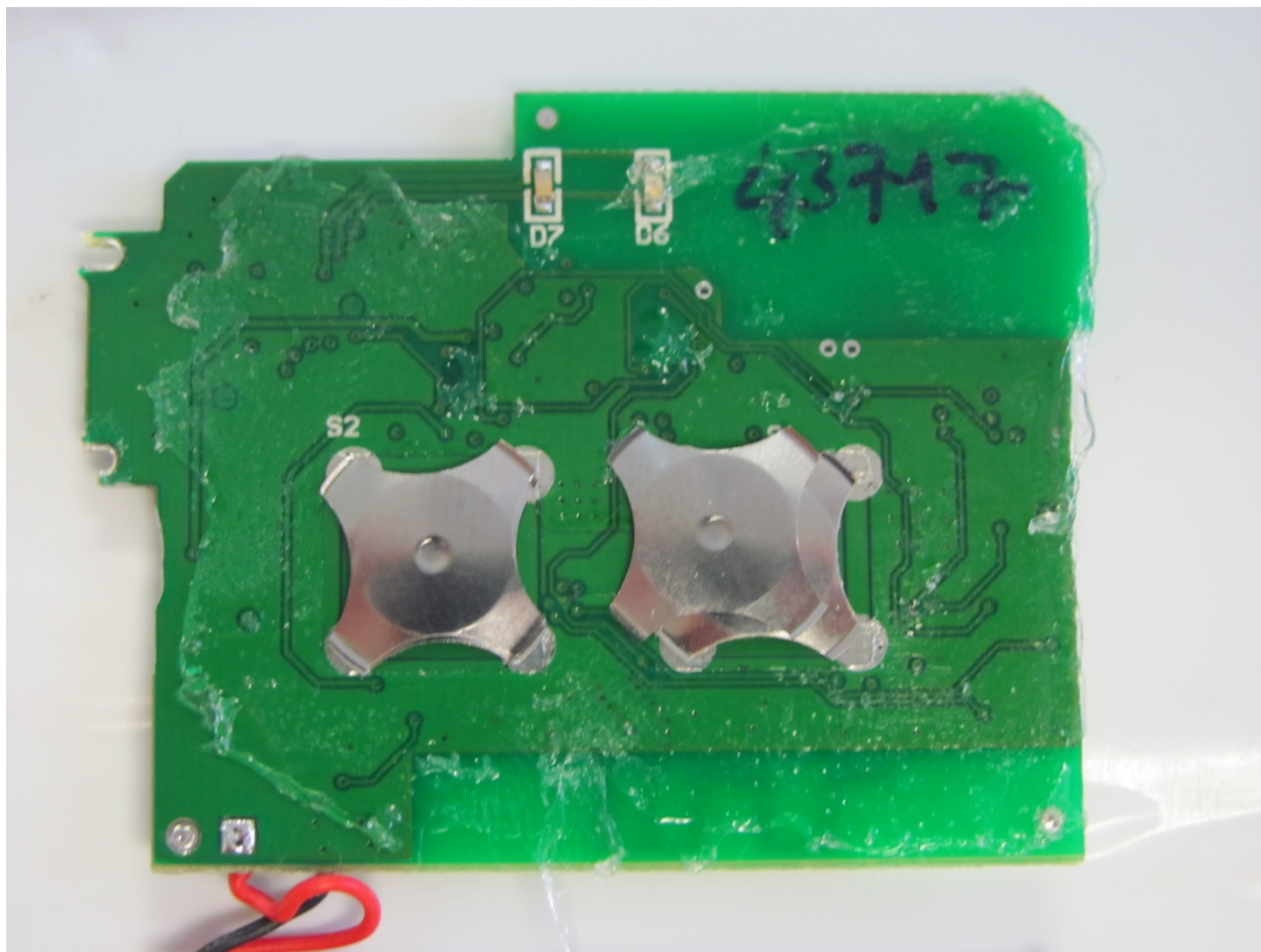
Figure 5. PCB Push Button Side (Back)

FCC Part 15 Certification 2AMOW-AT004H 17-0274 September 19, 2017 Sanitag Technologies Corp AT-004-H