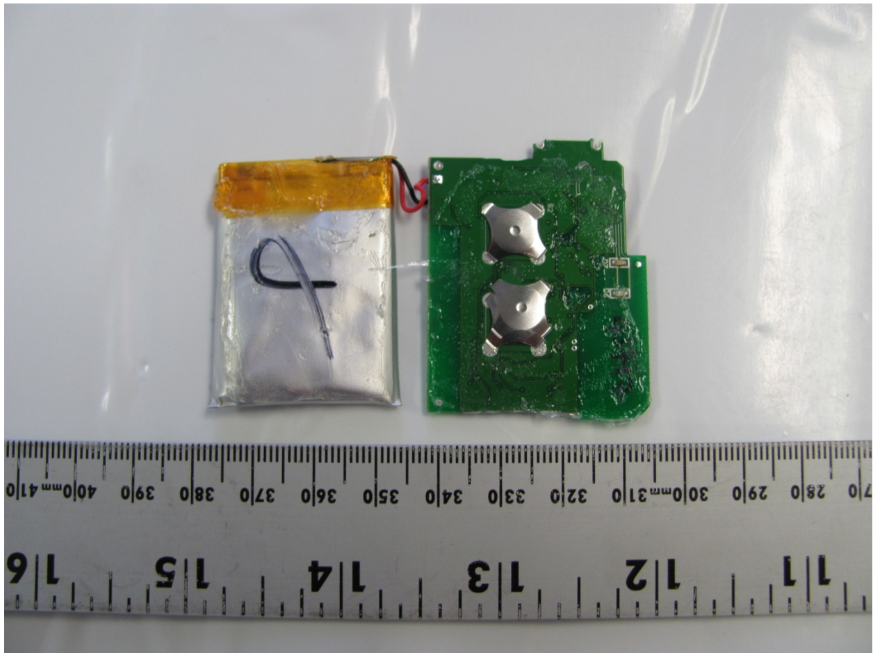
Figure 3. Push Button Side and Back of Battery Pack

FCC Part 15 Certification 2AMOW-AT004H 17-0274 September 19, 2017 Sanitag Technologies Corp AT-004-H