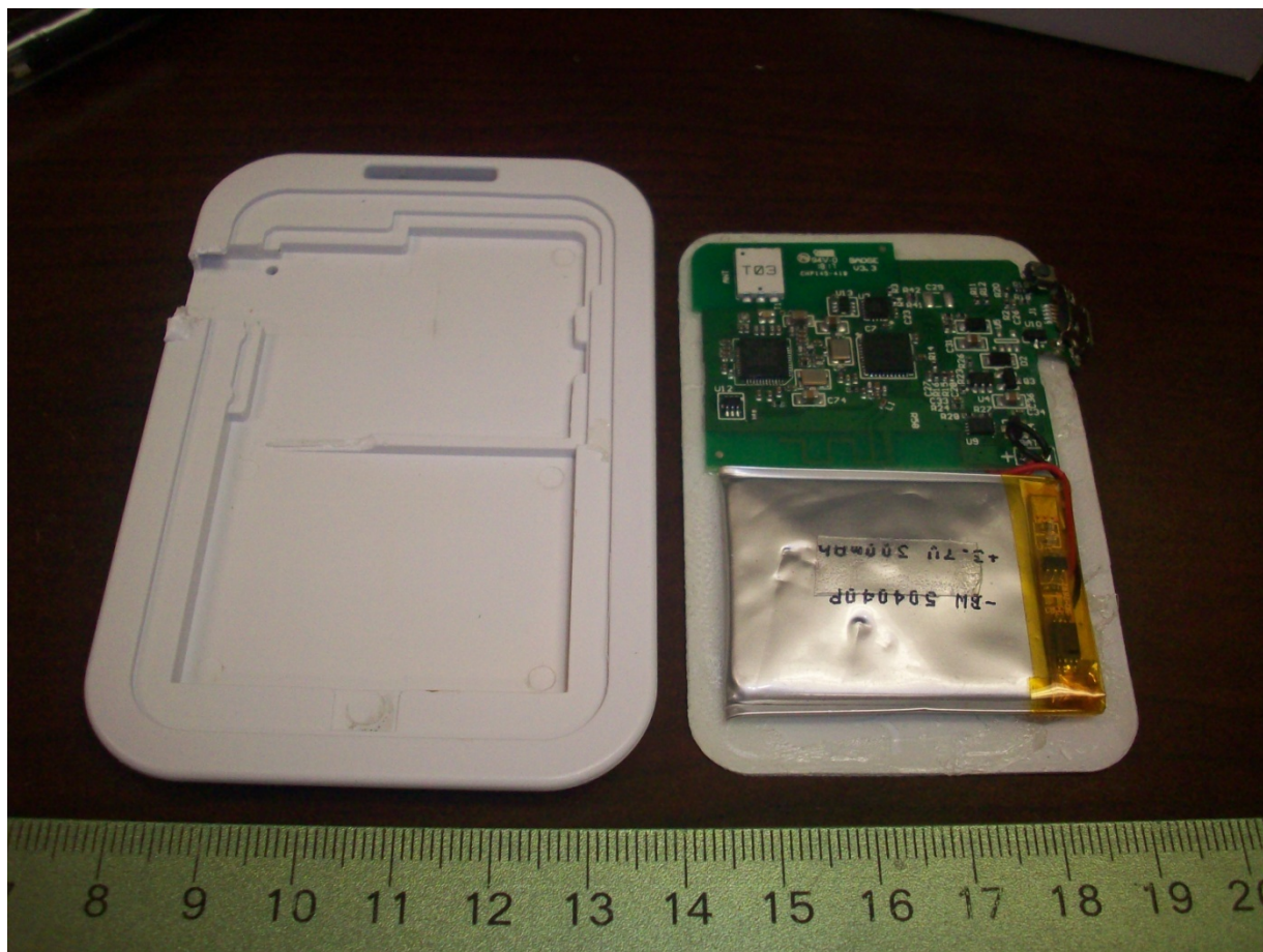
Figure 1. Internal View