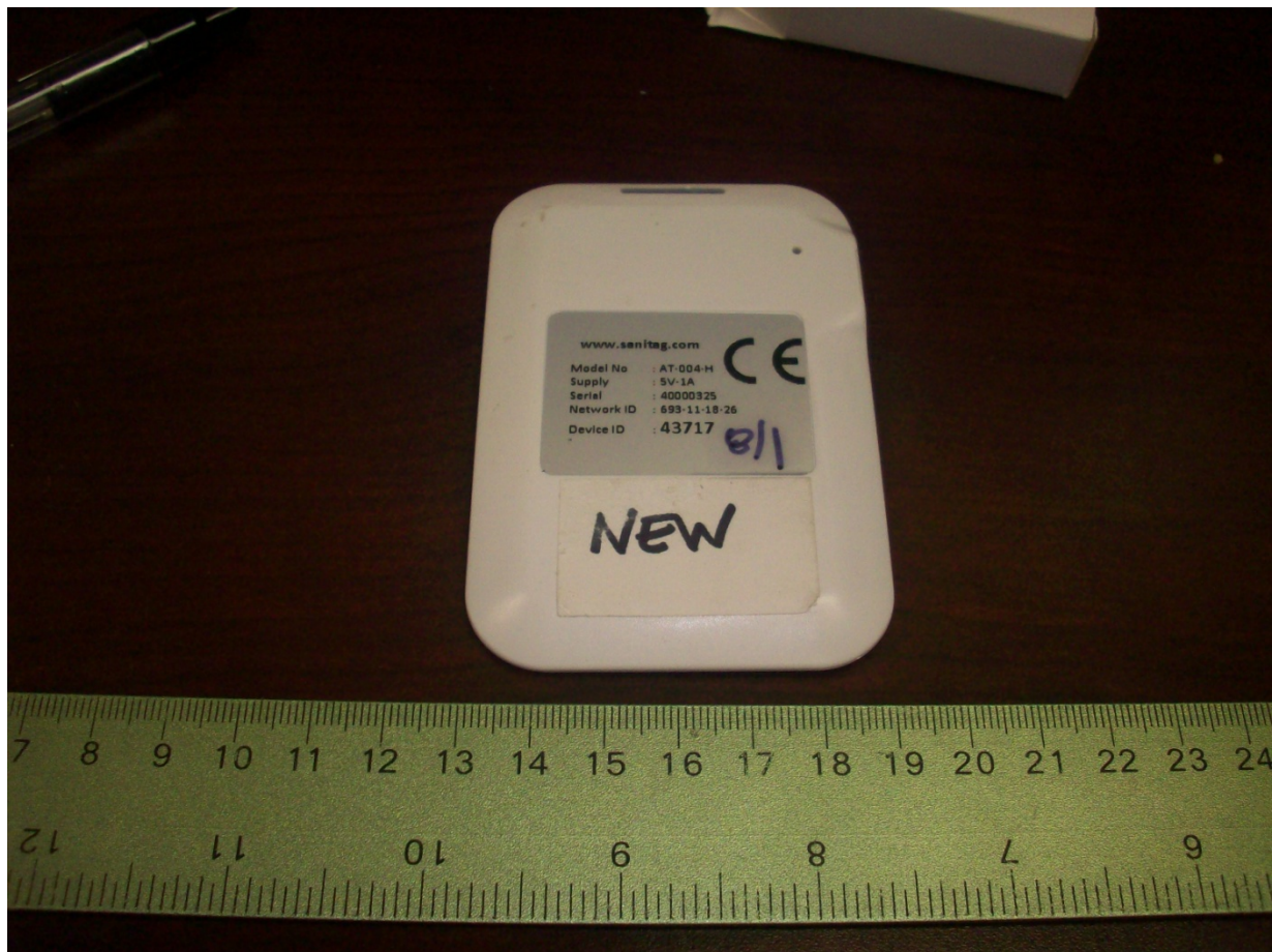
Figure 2. Back

FCC Part 15 Certification 2AMOW-AT004H 17-0274 September 19, 2017 Sanitag Technologies Corp AT-004-H