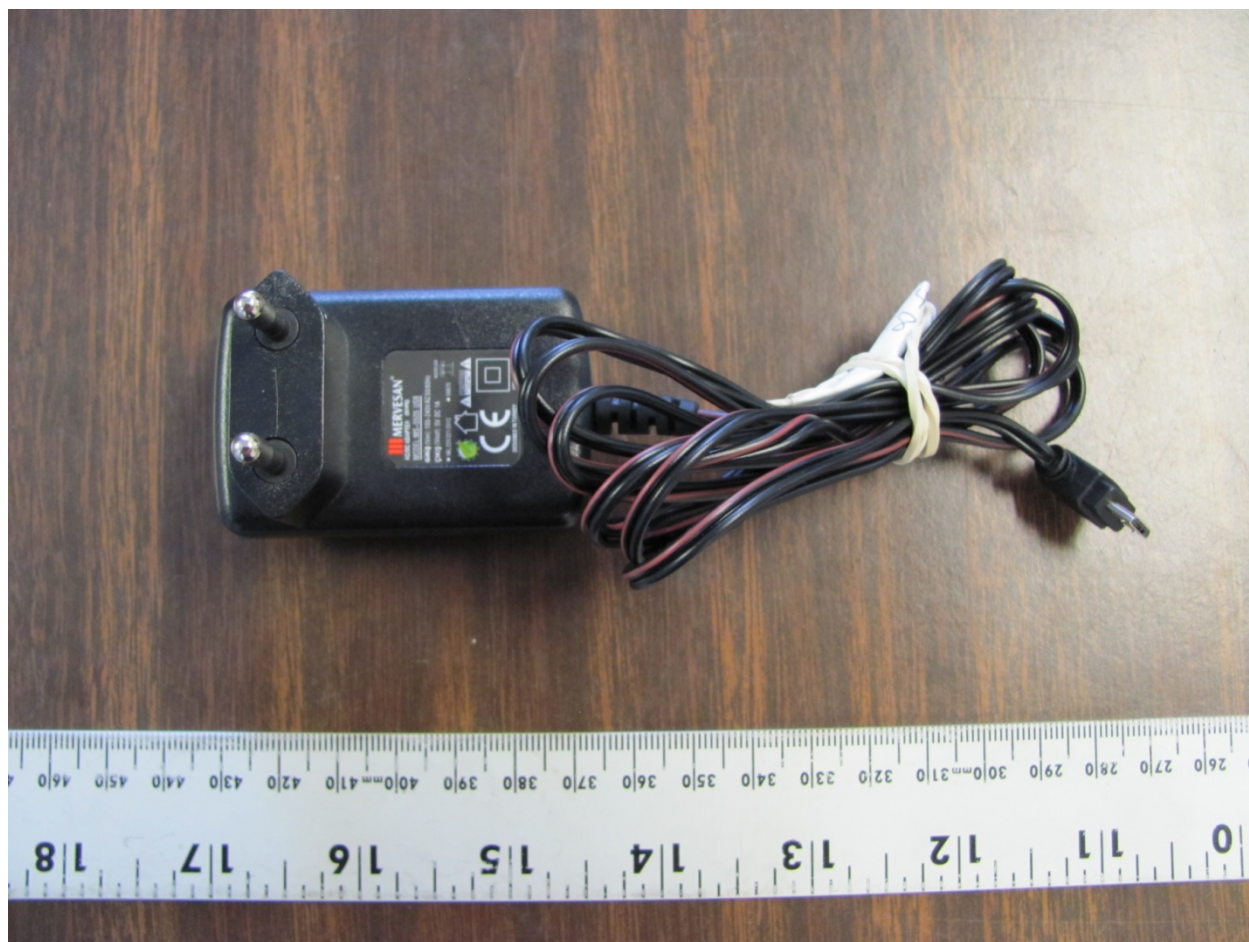
Figure 3. Adapter

FCC Part 15 Certification 2AMOW-AT004H 17-0274 September 19, 2017 Sanitag Technologies Corp AT-004-H