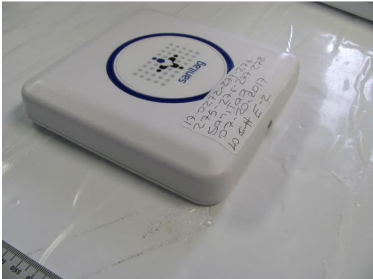
Figure 5. Sides 3 and 4

FCC Part 15 Certification 2AMOW-AR002HLR 17-0277 October 2, 2017 Sanitag Technologies Corp AR-002-HLR