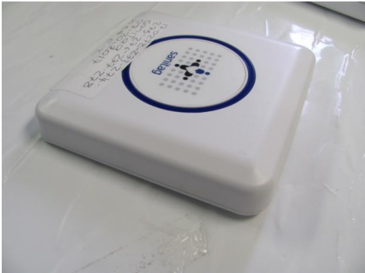
Figure 4. Sides 1 and 2

FCC Part 15 Certification 2AMOW-AR002HLR 17-0277 October 2, 2017 Sanitag Technologies Corp AR-002-HLR