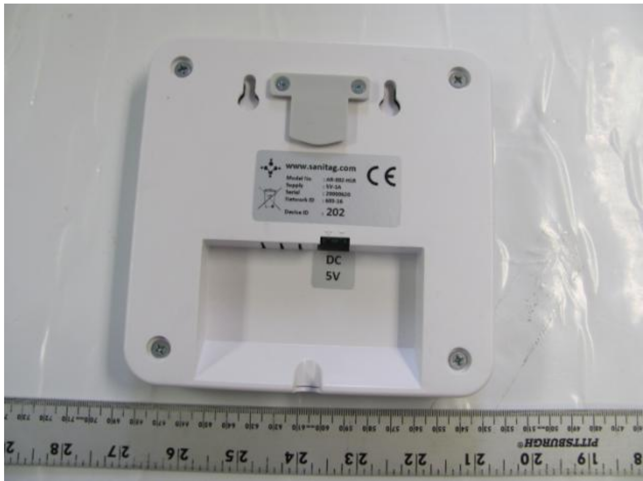
Figure 3. Back View

FCC Part 15 Certification 2AMOW-AR002HLR 17-0277 October 2, 2017 Sanitag Technologies Corp AR-002-HLR