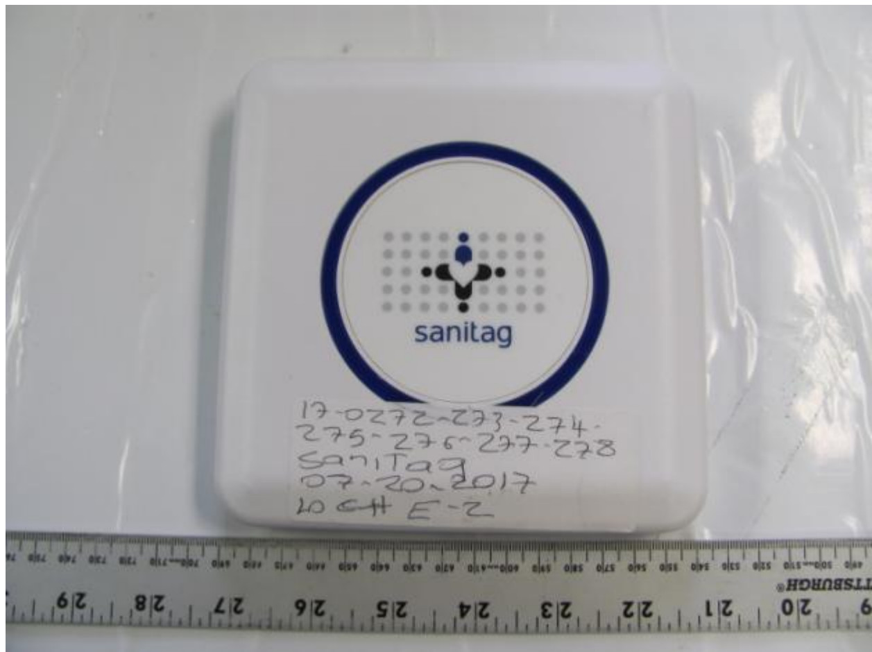
Figure 2. Front View

FCC Part 15 Certification 2AMOW-AR002HLR 17-0277 October 2, 2017 Sanitag Technologies Corp AR-002-HLR