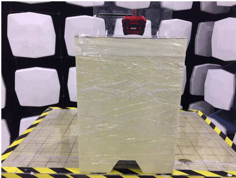
Above 1GHz (The EuT placed at the center of the turntable)