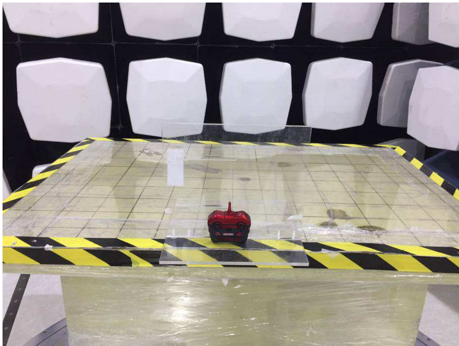
Up to 1GHz (The EuT placed at the center of the turntable)