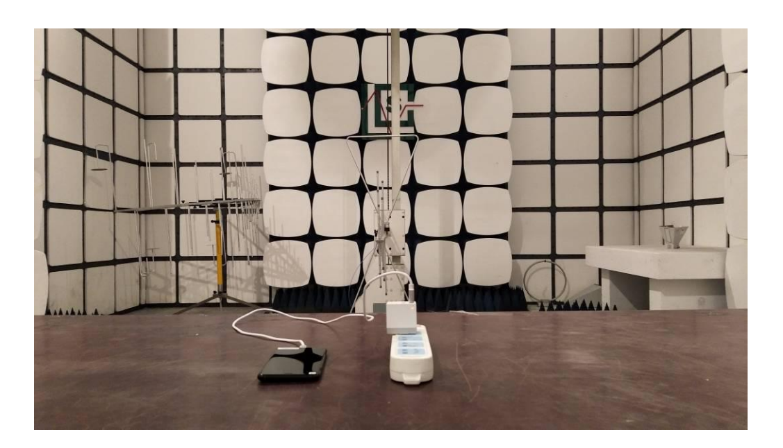
Fig. 1 (Below 1GHz)

Test Setup Photo(s) of Radiated Emissions Measurement