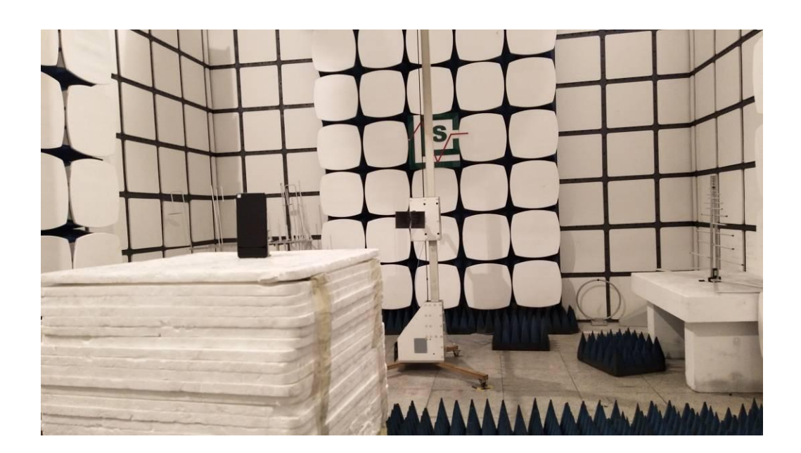
Fig. 2 (Above 1GHz)

This report shall not be reproduced except in full, without the written approval of Shenzhen LCS Compliance Testing Laboratory Ltd. . Page 1 of 2