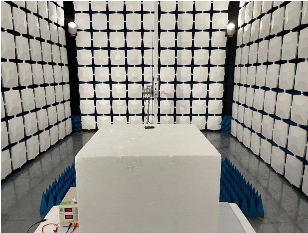
Above 1GHz for radiated emission test setup