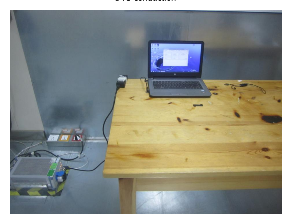
DTS radiation L