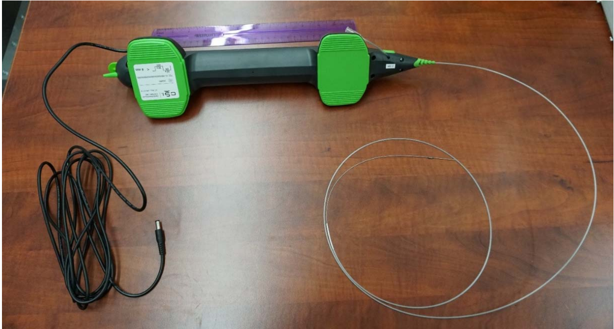
Bottom View showing Label Location