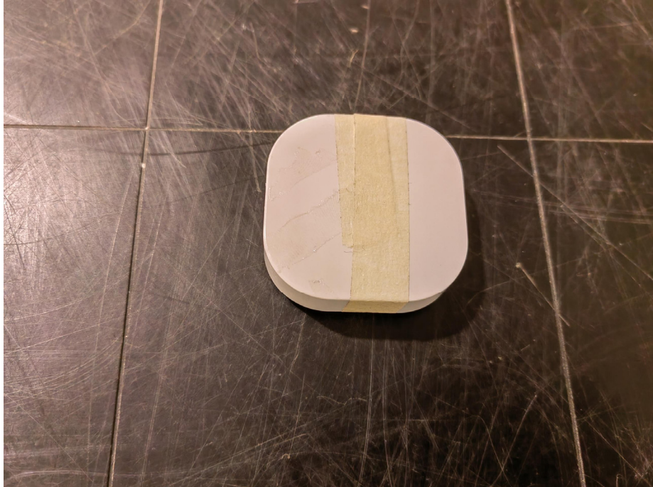
For Above 1GHz Test Site 1#