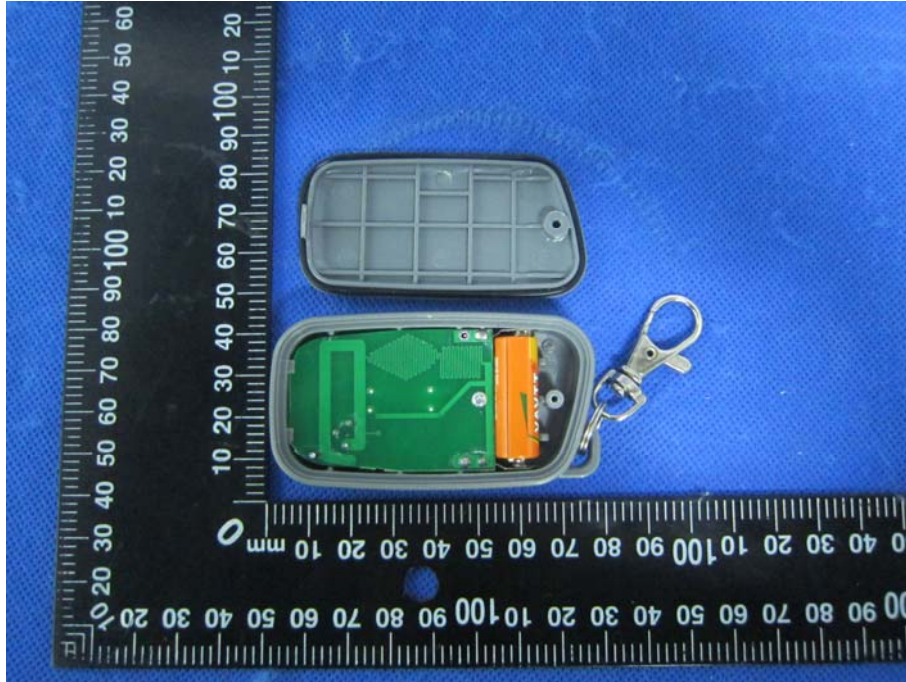
Photo 4 Appearance of PCB