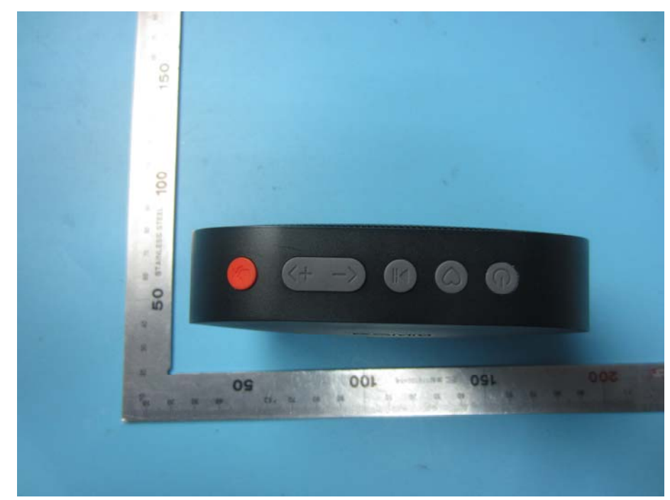
TOP VIEW OF SAMPLE