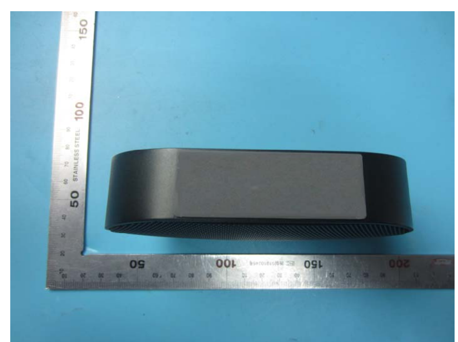
BOTTOM VIEW OF SAMPLE