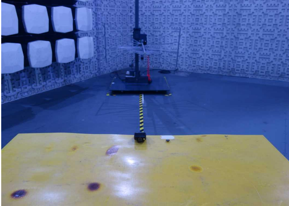
Spurious emissions at antenna terminals (Above 1GHz)