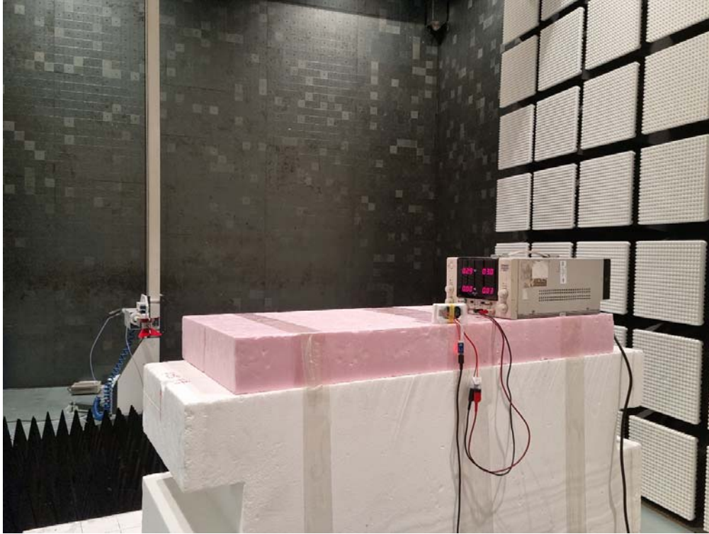
18 GHz to 26 GHz