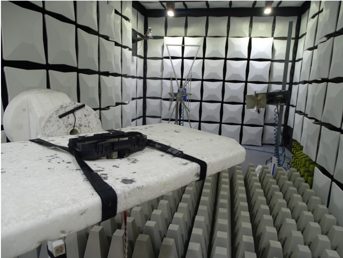
Photo 2: Test setup for radiated measurements (stand alone, EUT supplied by a battery) Above 1 GHz