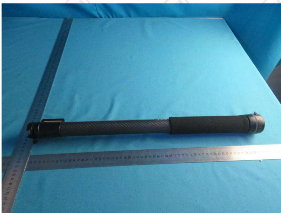
View of Product-6