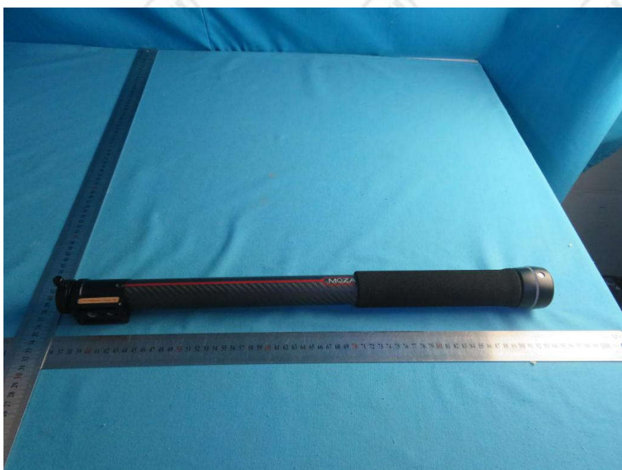
View of Product-4