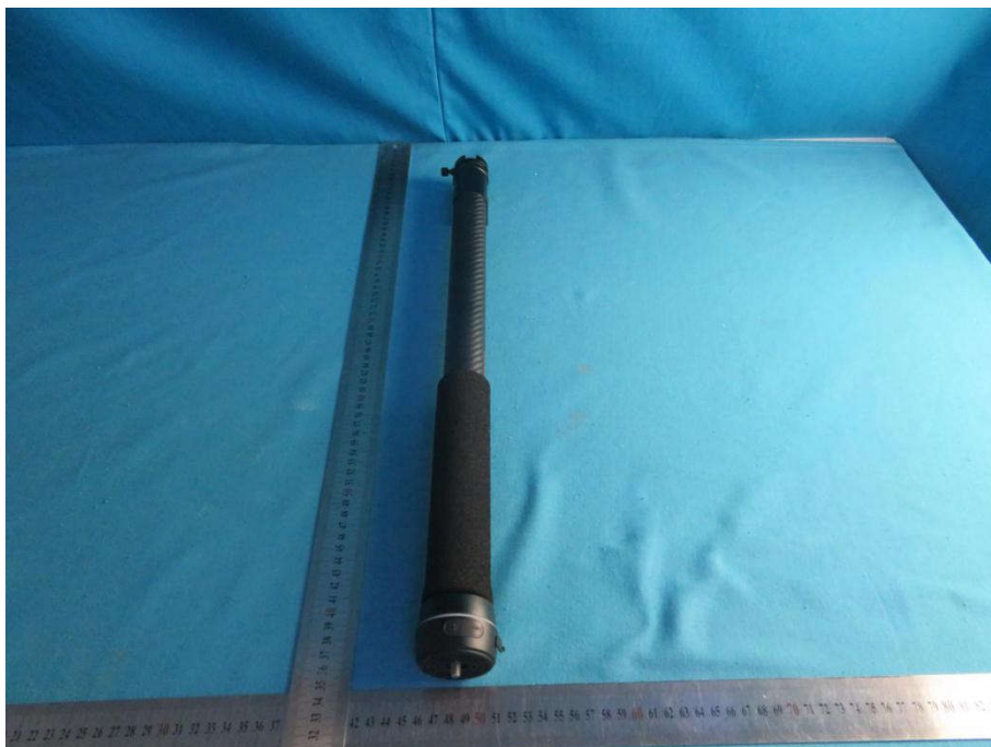
View of Product-3