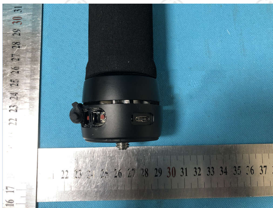
View of Product-10