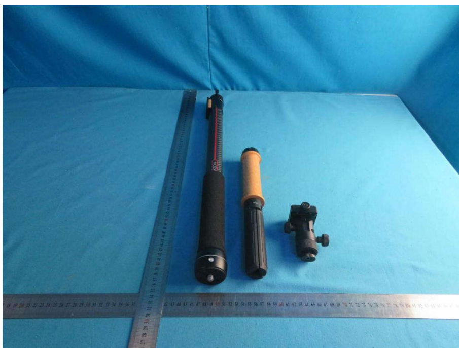
View of Product-2