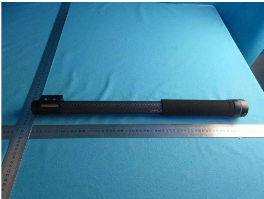
View of Product-5