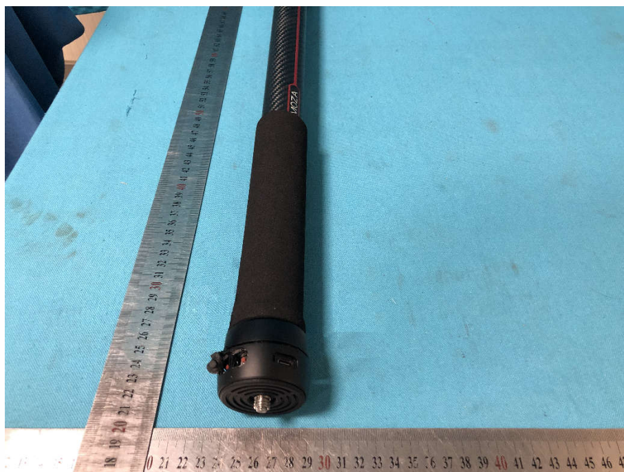
View of Product-9