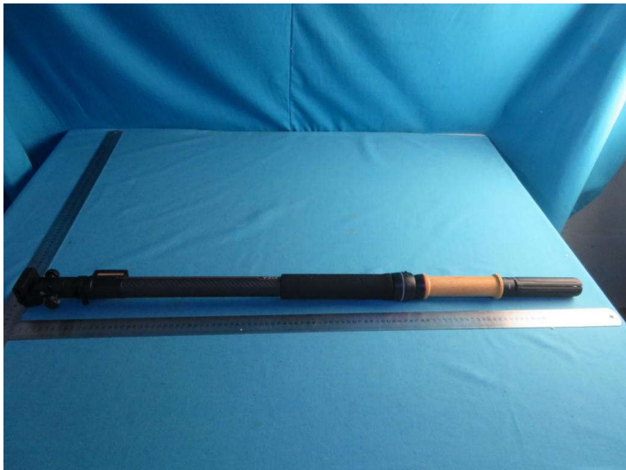
View of Product-1