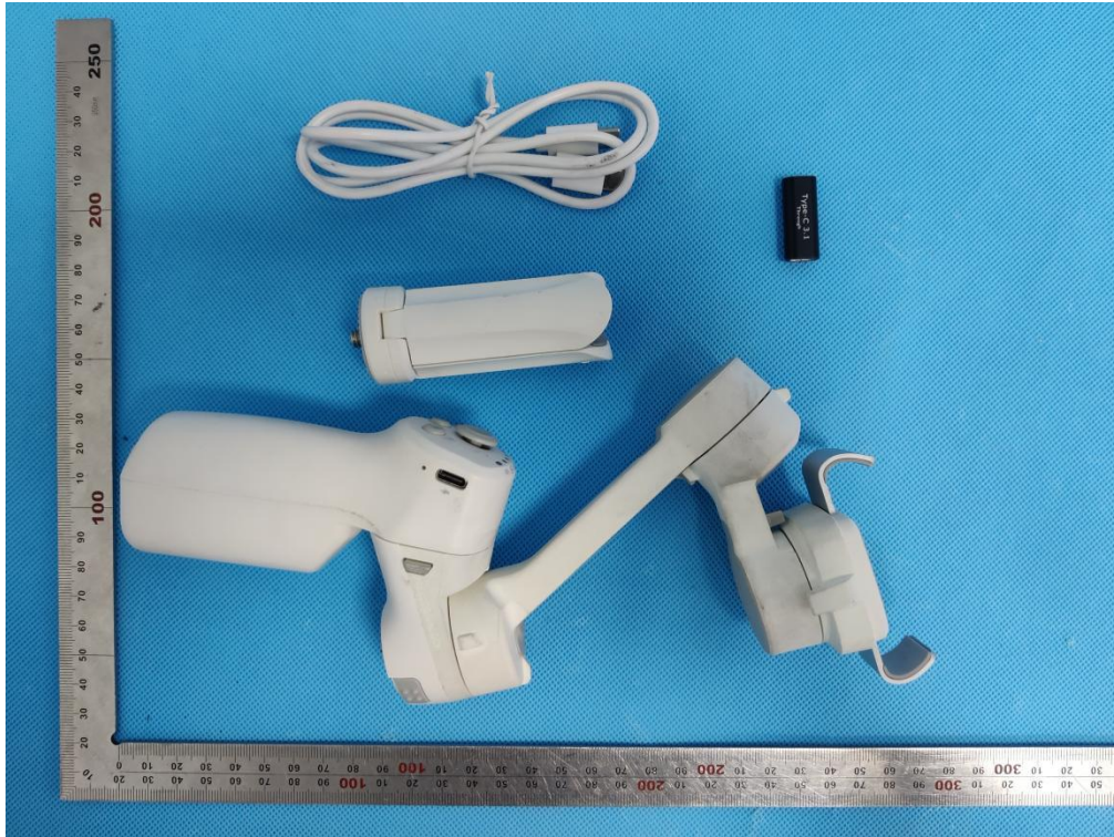
TOP VIEW OF EUT