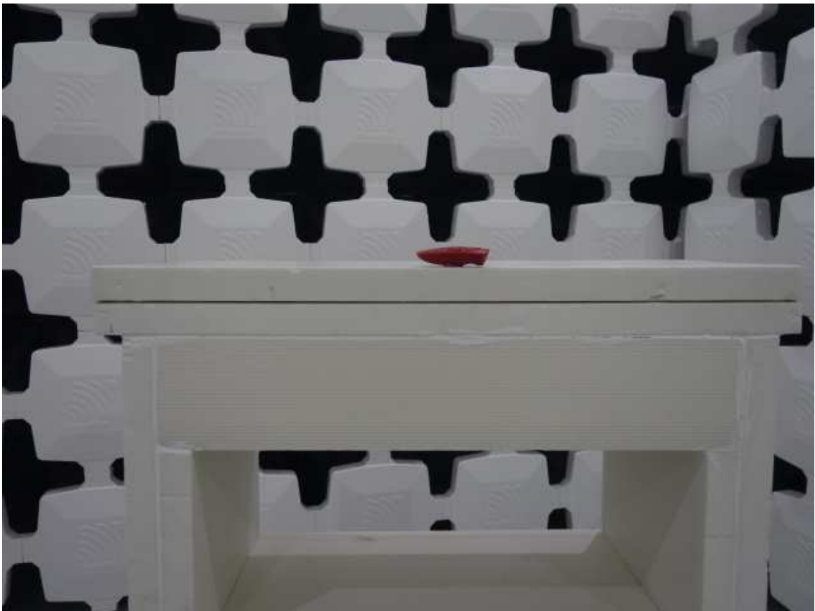
Above 1GHz (The EuT placed at the center of the turntable)