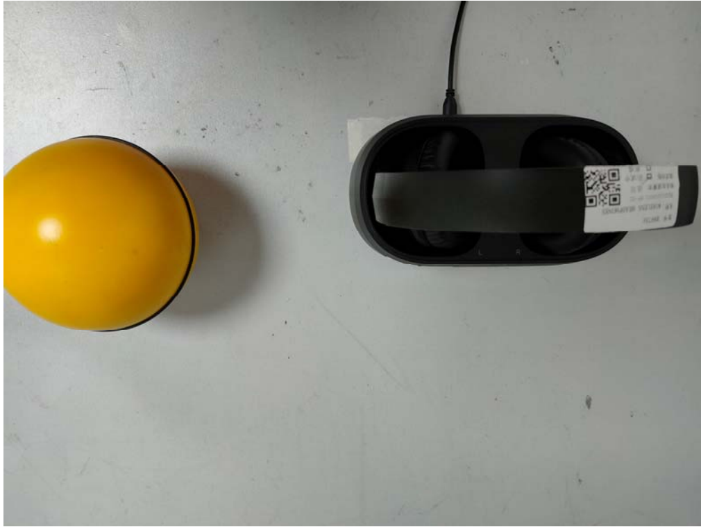
Position B: 15 cm