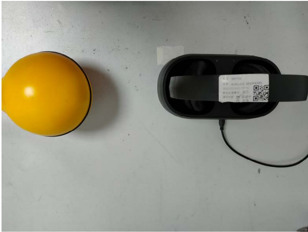
Position D: 15 cm