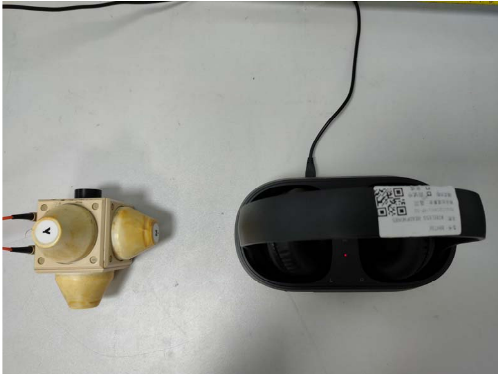
Position B: 15 cm