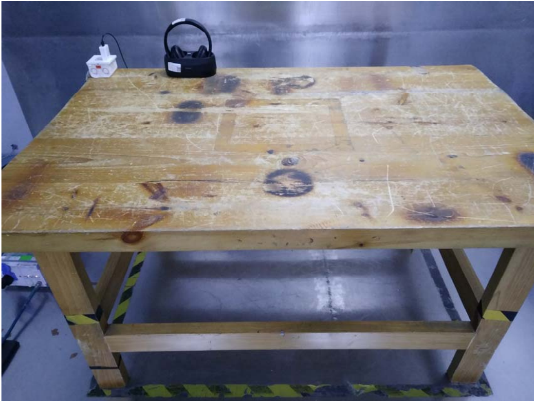
Conducted Emissions Side View