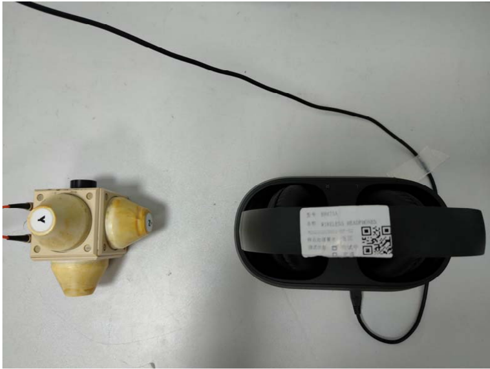
Position D: 15 cm