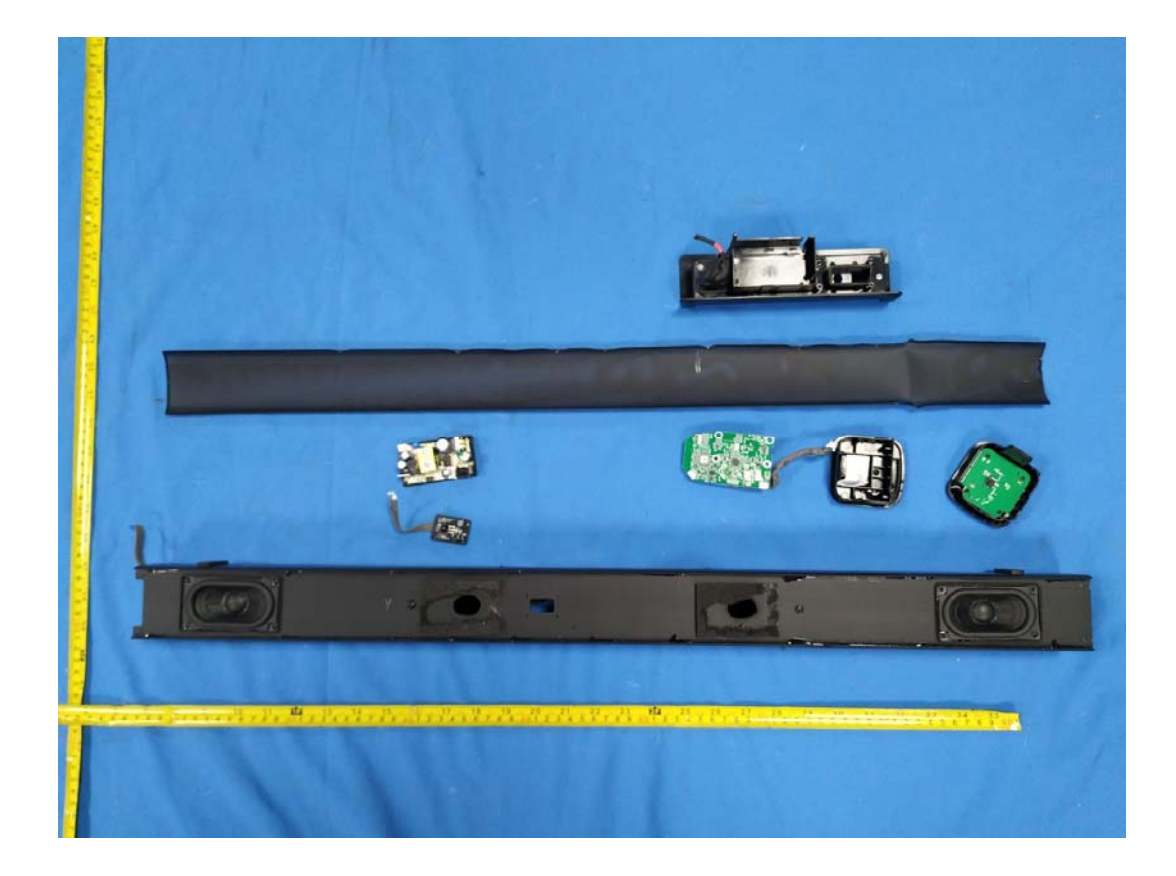
EXHIBIT C - EUT INTERNAL PHOTOGRAPHS