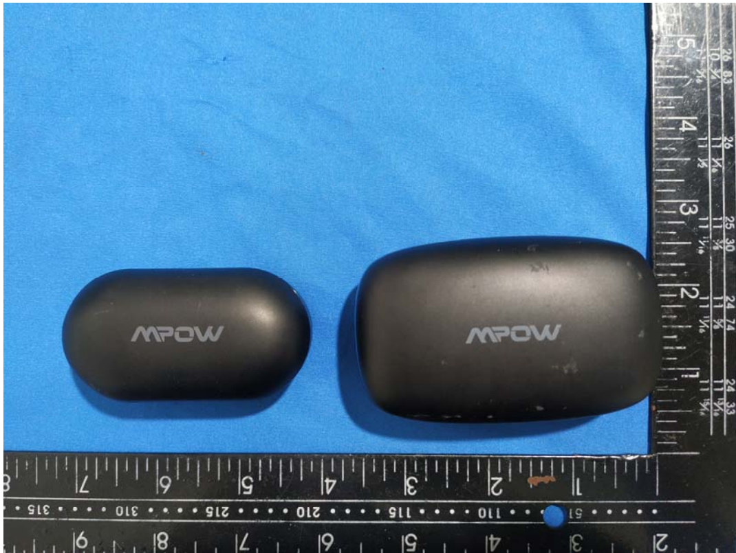
EXHIBIT B - EUT EXTERNAL PHOTOGRAPHS