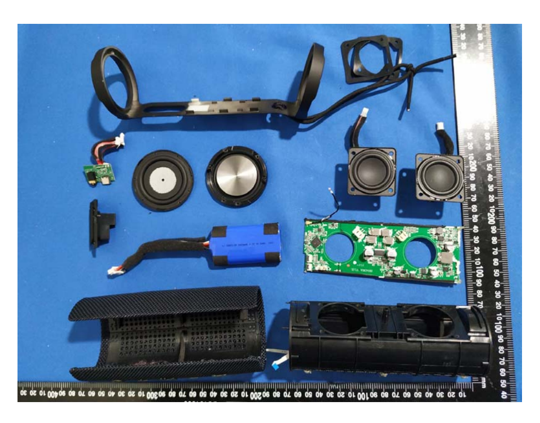
EXHIBIT C - EUT INTERNAL PHOTOGRAPHS