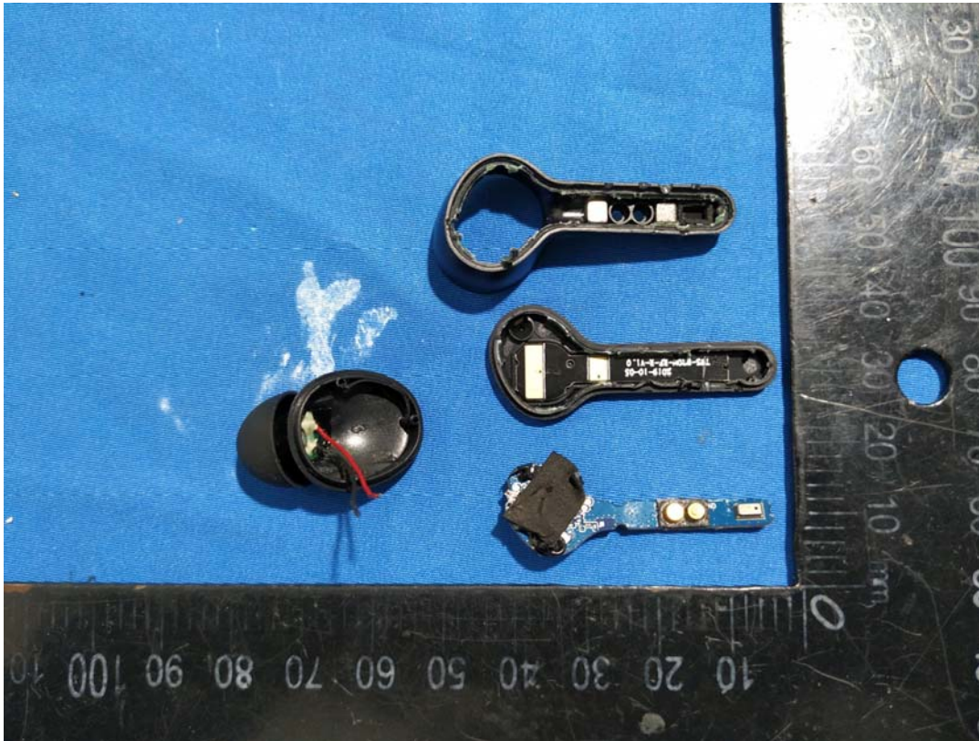
EXHIBIT C - EUT INTERNAL PHOTOGRAPHS