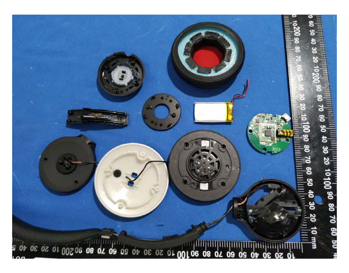
EXHIBIT C - EUT INTERNAL PHOTOGRAPHS