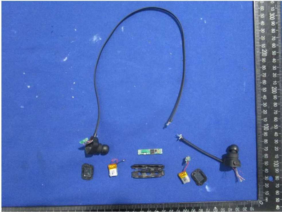
EXHIBIT C - EUT INTERNAL PHOTOGRAPHS