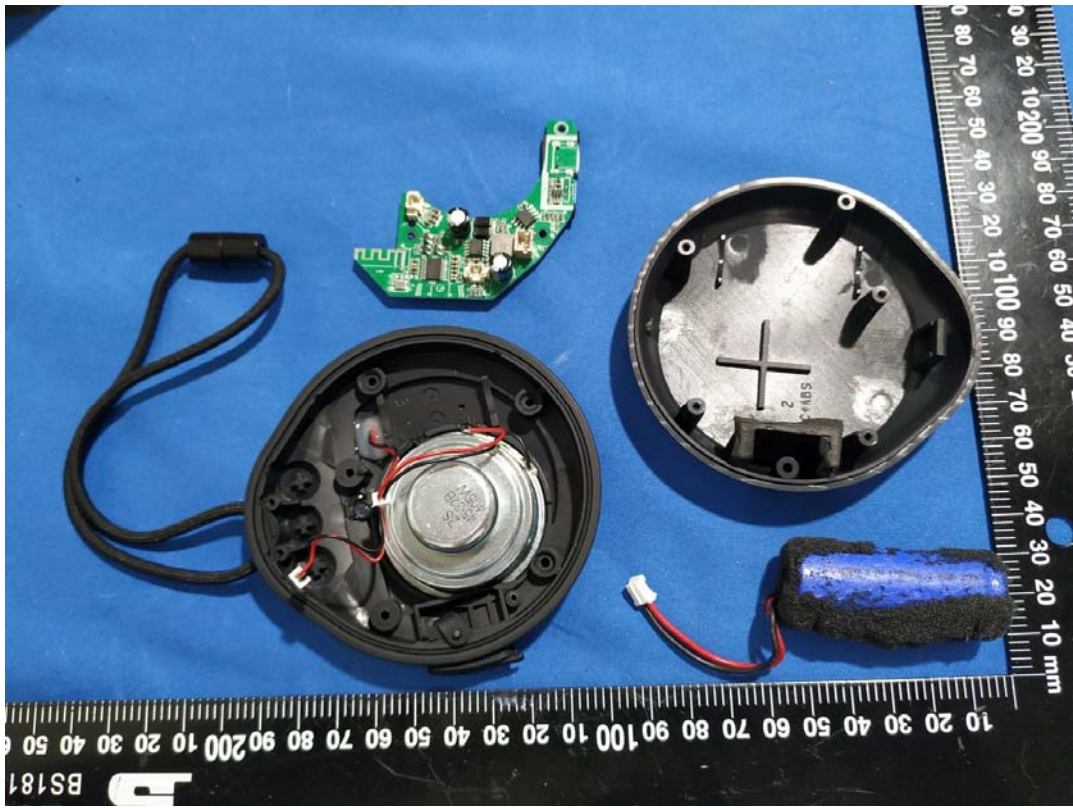
EXHIBIT C - EUT INTERNAL PHOTOGRAPHS