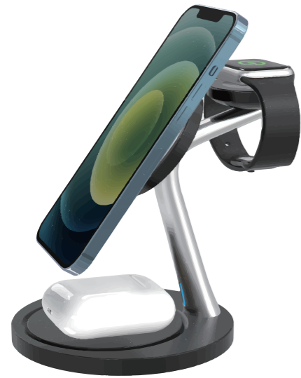
3 in 1 Magnetic Wireless Charger station