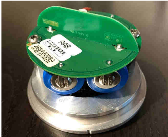
Battery connects onto underside of antenna PCB