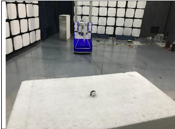
Nano: horizontal orientation: 30-1000 MHz EUT on 0.8m table