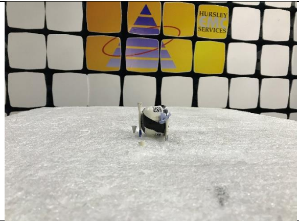
Nano: horizontal orientation: 30-1000 MHz; close-up EUT on 0.8m table