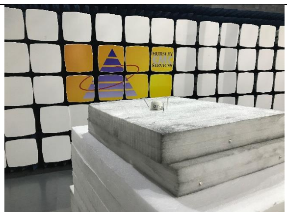
Nano: vertical orientation: > 1 GHz; close-up EUT on 1.5m table. Absorber on floor between antenna and EUT