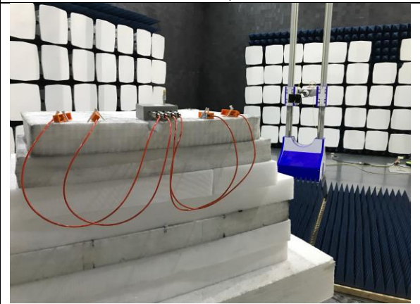
Node + cables: > 1 GHz; EUT on 1.5m table