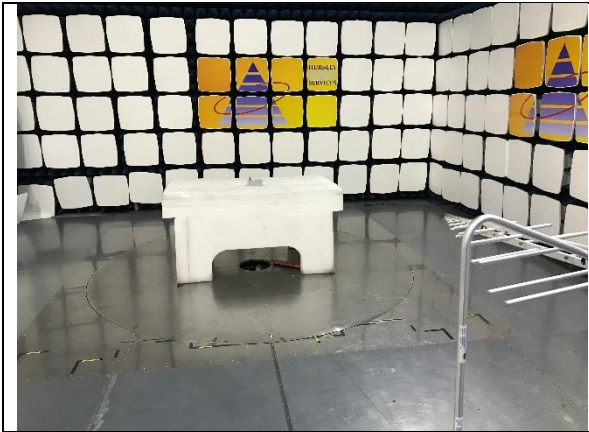
Node: 30-1000 MHz; EUT on 0.8m table