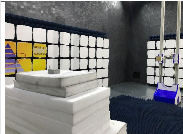
Node: > 1 GHz; EUT on 1.5m table