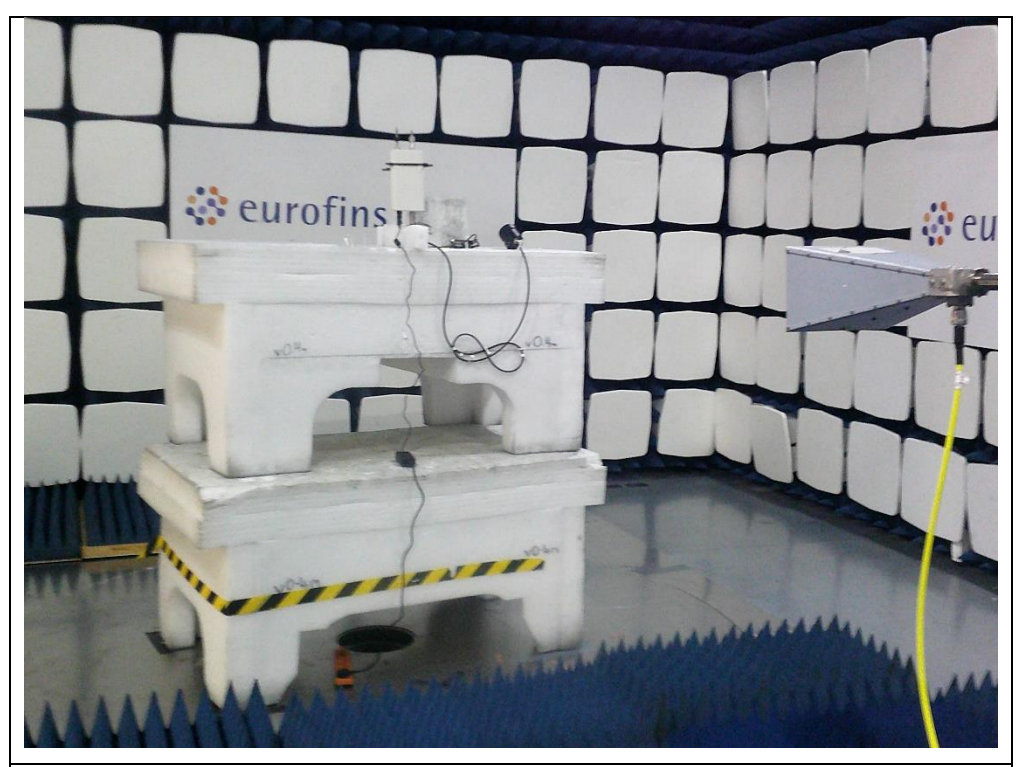
Above 1 GHz for FCC 15.247