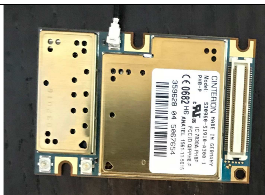
Reverse side of module