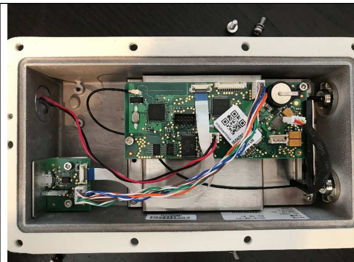
Inside of main box Metal box in base is battery cover