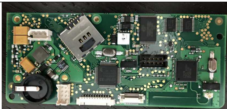
Top-side of main PCB