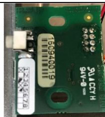
Underside of small PCB