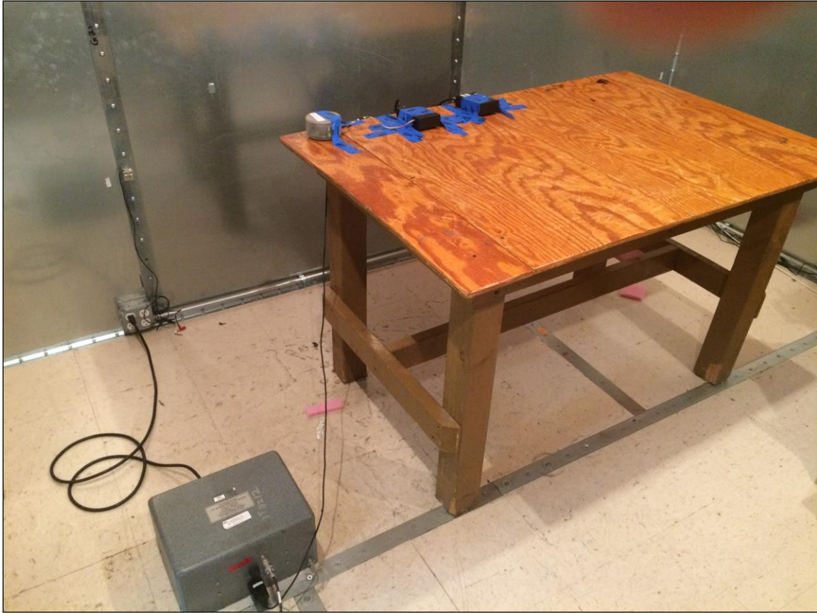
Photograph 1. Conducted Emissions, 15.207(a), Test Setup