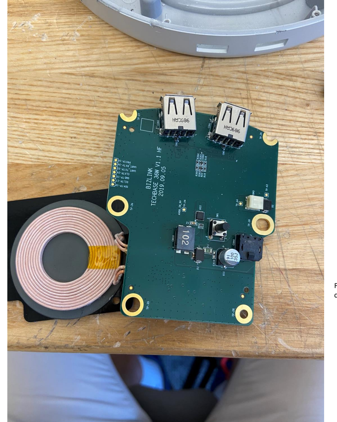
Fig 4. Bottom of PCBA w/ wireless charging module connected.