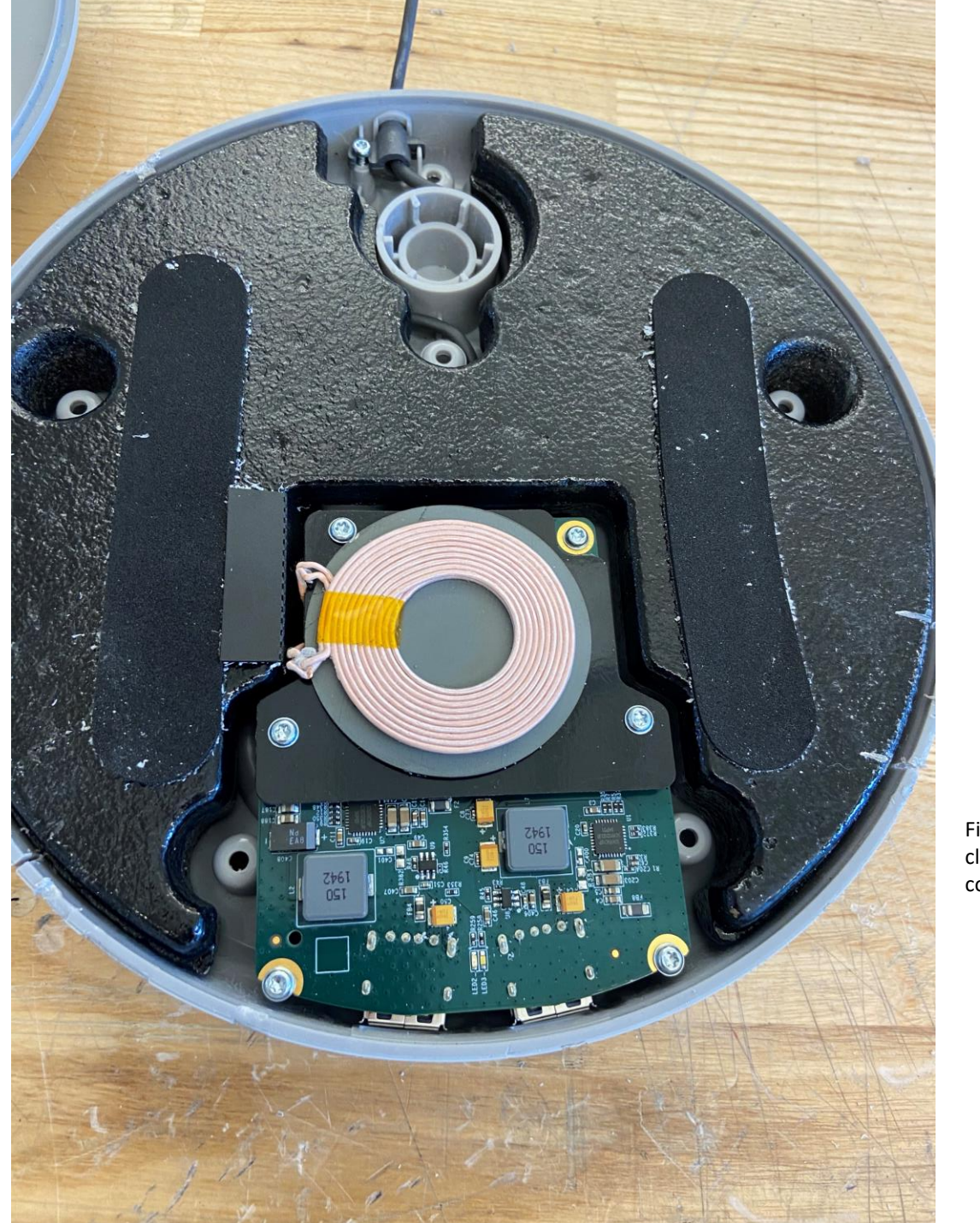
Fig 1. Inside of the Wireless Charging Desktop Base. Top clamshell housing removed. In view: cast iron counterweight, wireless charging module, PCBA.