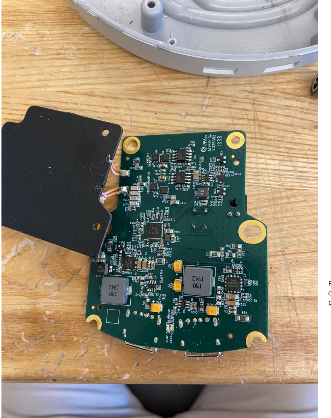
Fig 4. Top of PCBA w/ wireless charging module connected. Wireless charging module is affixed to a plastic support board.