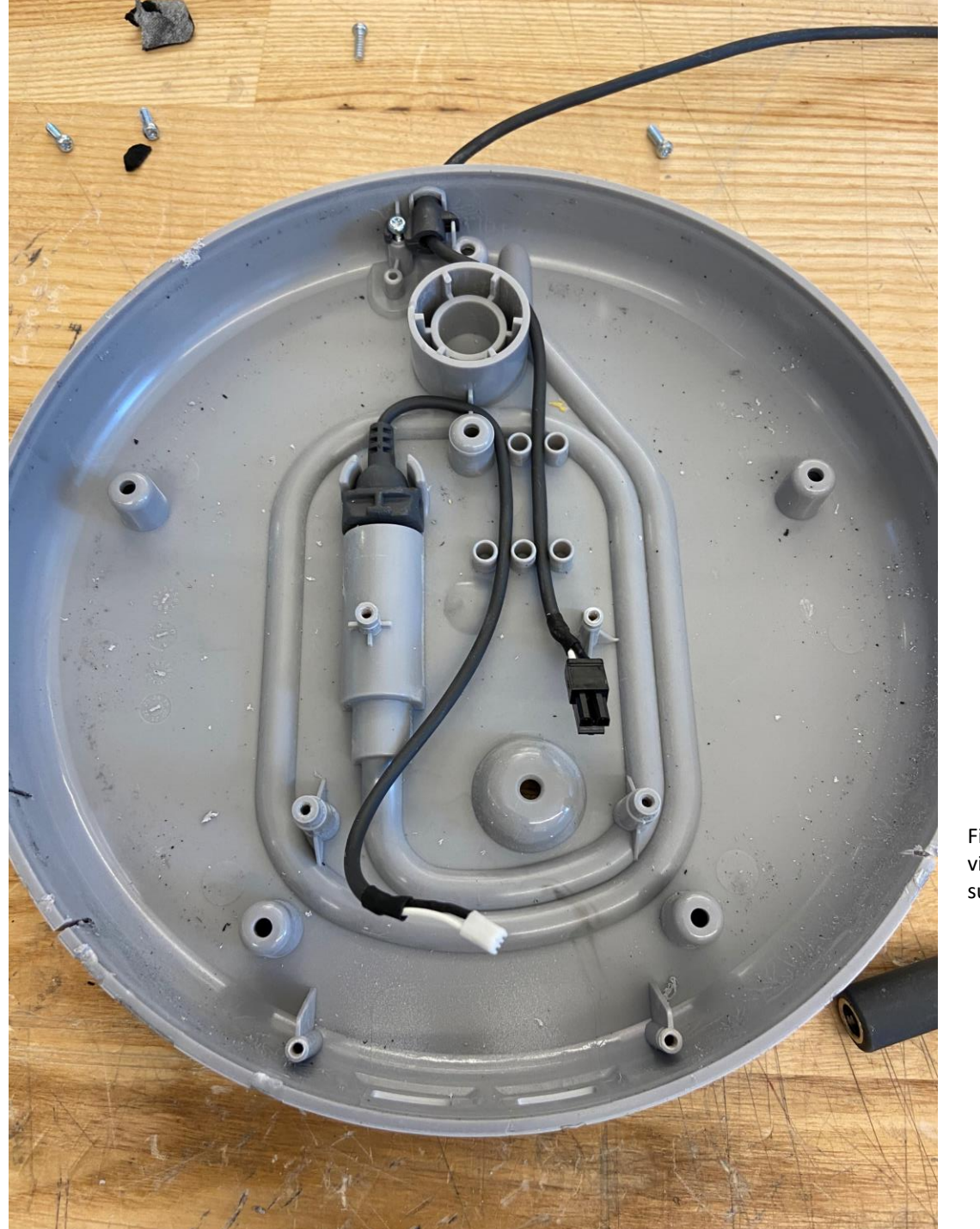
Fig 3. Inside of clamshell housing. Internal wire routing visible. Cable with black connector, connects to power supply, white connector plugs into PCBA, not shown here.