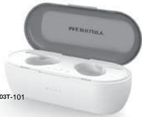
User's Manual for MI-E003T-101