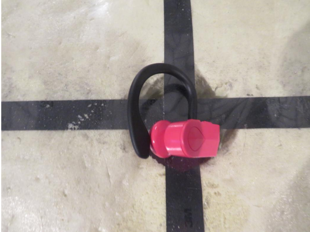
Radiated emission (Above 1000MHz)