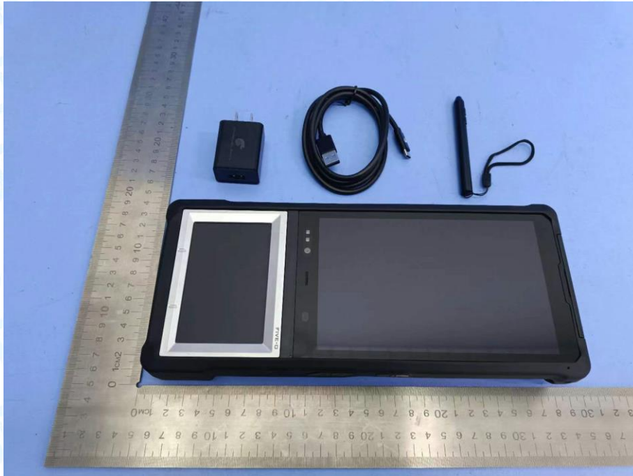
Photo 2 Appearance of Adapter