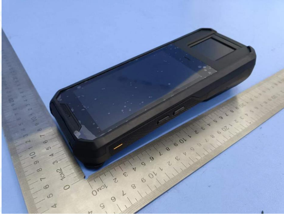
Photo 4 Appearance of EUT