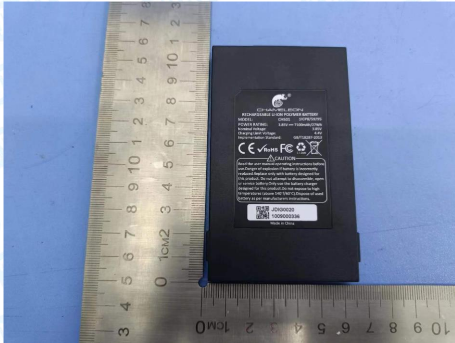
Photo 8 Appearance of EUT