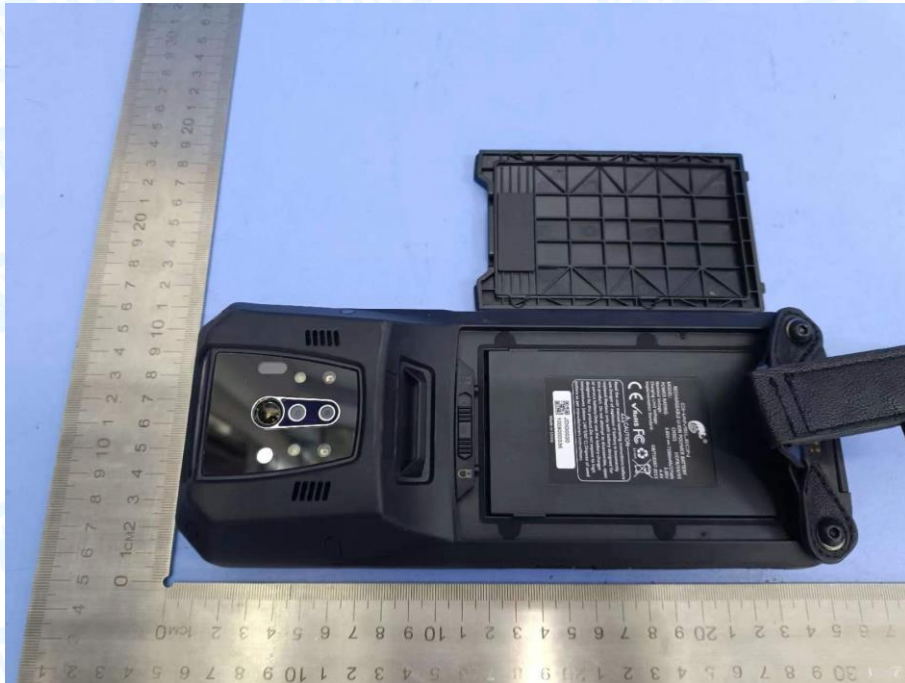
Photo 6 Appearance of EUT