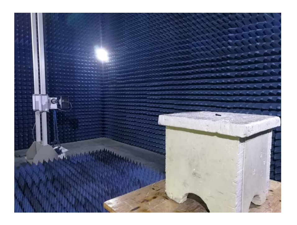
Photograph of set-up for conducted Emission