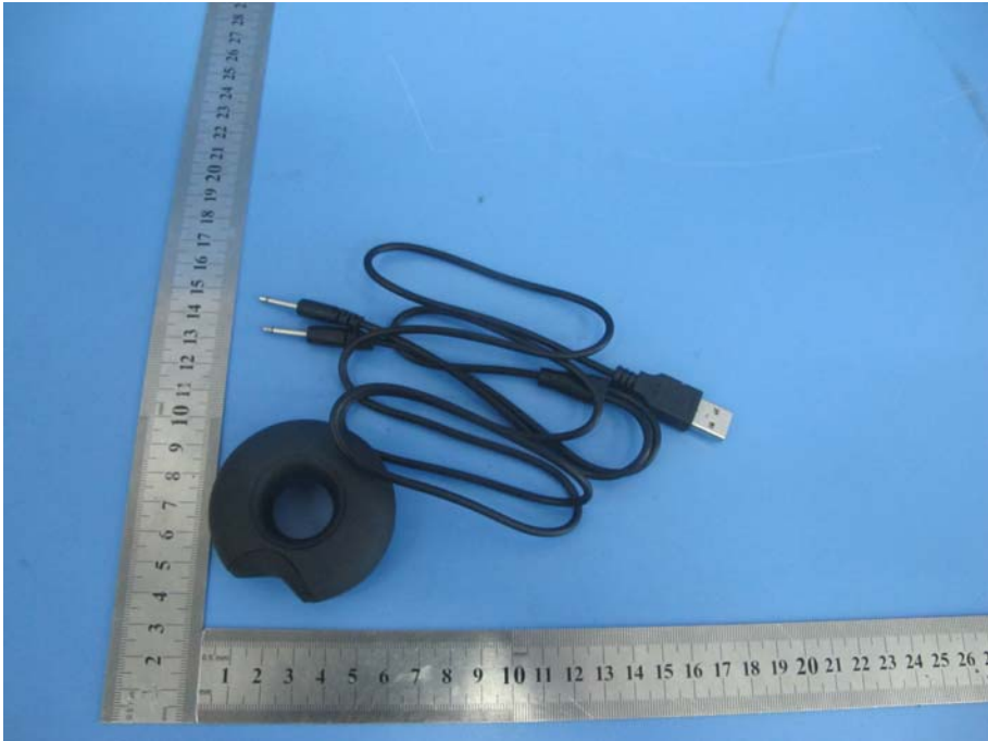
Photo 2 Appearance of EUT