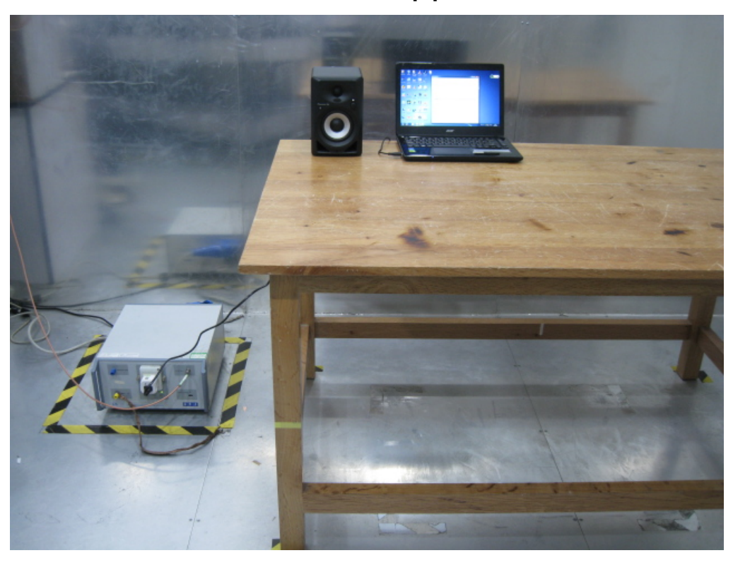
Radiated Setup photo (Below 1G)