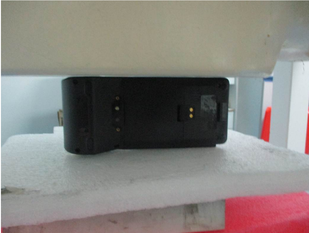
Handheld Right Setup Photo (0mm)