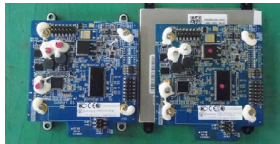
6. FCC label location on IC