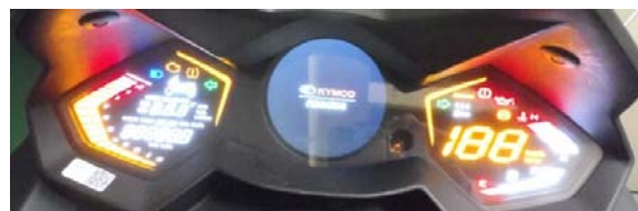
8. Final production