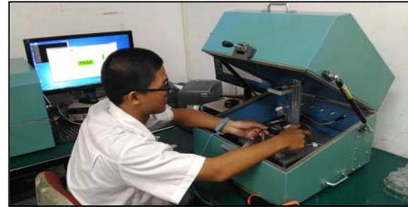
4. Wireless function check