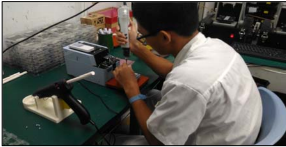
3. Assemble LCD and IC board