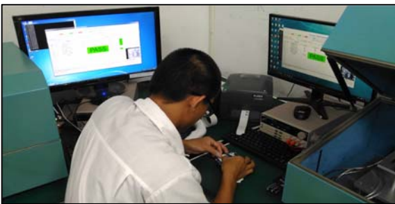
5. Stick the FCC label