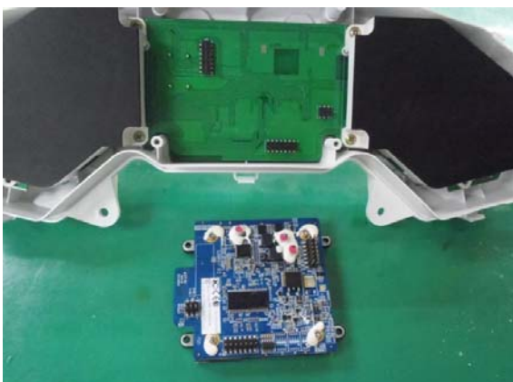
7. Assemble Noodoe and Speedmeter