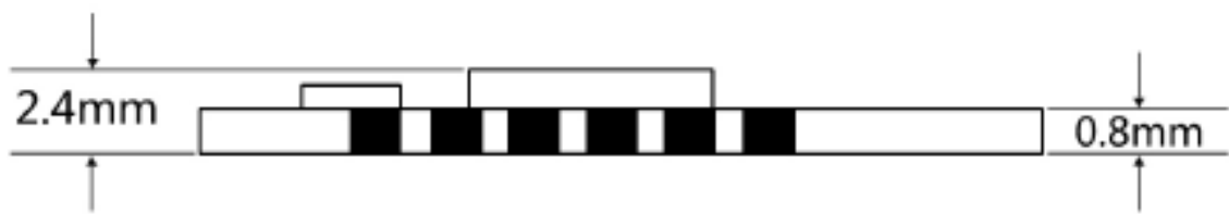
图-5 模块尺寸 (侧视图)