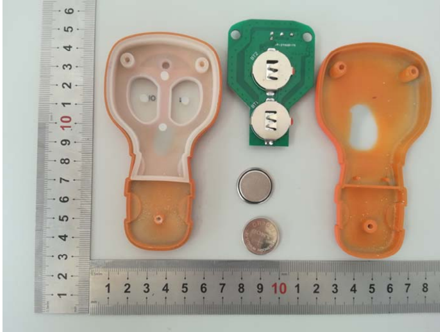
EUT – Cover off View-2